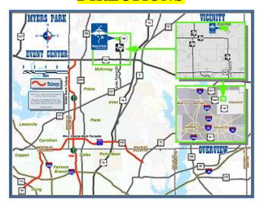
Myers Park and Event Center (MPEC)

McKinney is located approximately 33 miles north and east of downtown Dallas via U.S. Highway 75 (North Central Expressway). From U.S. Highway 75, take the Highway 380 Exit (Exit 41), and head WEST approximately 2.5 miles until you reach FM 1461. Turn right/North on FM1461 and travel approximately 3.8 miles to County Road 166. Turn right/North on County Road 166 Go about a mile. You will see the MPEC on your left. Do not turn in. Continue until you reach the stop sign at County Rd 168. Turn left/West onto County Road 168.